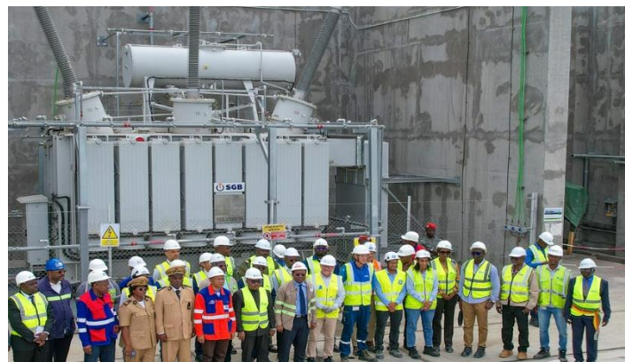
Family picture in front the transformer N°3