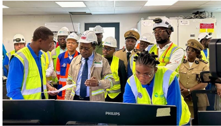
The Minister of Energy and Water Resources visiting Nachtigal's control room

Once fully commissioned in early 2025, the energy produced by Nachtigal will cover about 30% of Cameroon's electricity needs.