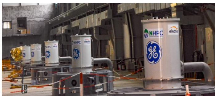
View of the 5 Nachtigal units commissioned

NHPC is committed to deliver the entire Nachtigal hydropower facility by early 2025 to ensure Cameroon has an available and competitive supply of green electricity.