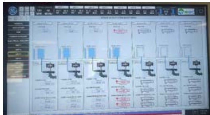
Picture of Nachtigal's control room's main screen, displaying the 3 units under production