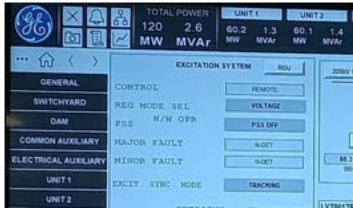
Partial view of one of the HMI's (Human Machine Interface) control screens

Unit N°2 commissioning now brings the power generated by Nachtigal to 120MW. Teams remain fully committed to the next stage, which is the commissioning of Unit N°3, whose first wheel turns took place on the 9 th of August, and the testing phase immediately got under way.