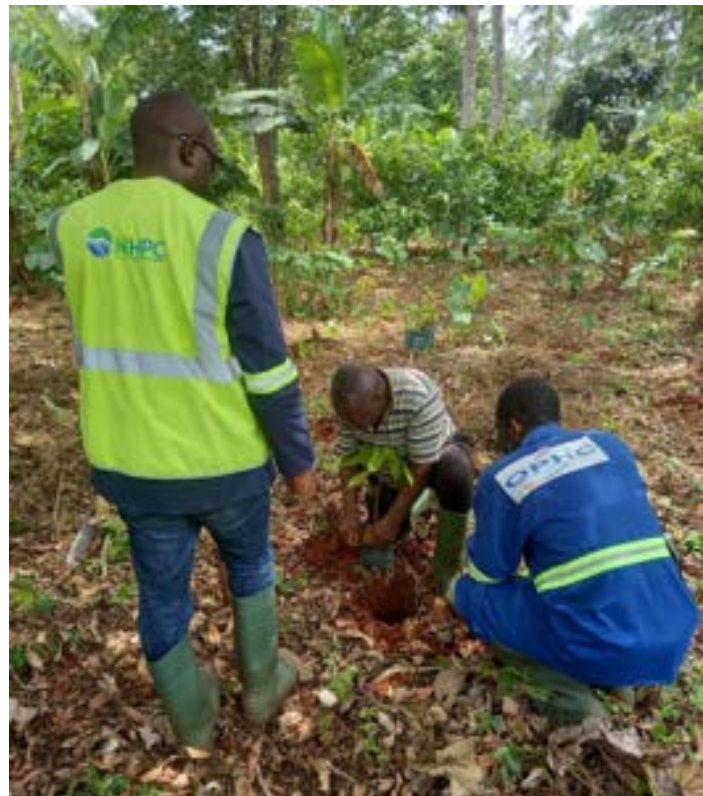
Cocoa plants planted by a beneficiary PAP

In accordance with the agricultural schedule, these beneficiary PAPs directly planted their seeds and will benefit from technical monitoring to help them obtain maximum benefit from these seeds.