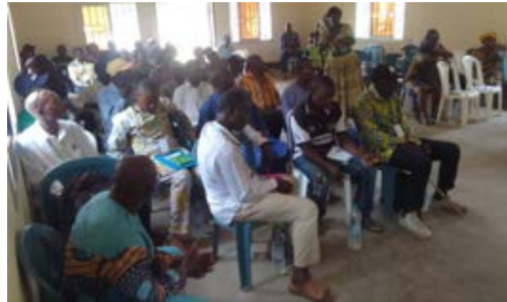
Stakeholder consultation meetings on the fisheries management plan

Meetings are taking place in Batchenga, Ntui and Mbandjock localities and will run until the 29 th of February 2024, with the aim of gathering ideas from everyone to define a strategy that can both meet fishermen, fishmongers and riverside communities needs and guarantee the sustainability of the fisheries resources of the Nachtigal's reservoir.