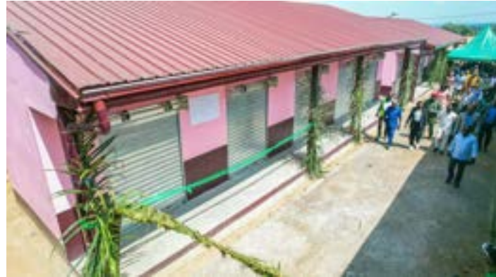
Picture of the newly built shops

NHPC has made a number of social investments in the Ntui district over the past years. Among the most important are the construction of a community center in Bindandjengué, five boreholes in Bindandjengué, Ndowé and Ombandéné, a water tower at the Ntui district hospital, the construction and equipment of an administrative building at the Ombandéné primary school and a clothing workshop at Ntui's RA/HEC. Through these, NHPC expects to make a sustainable contribution to the socio-economic development of the Ntui district.