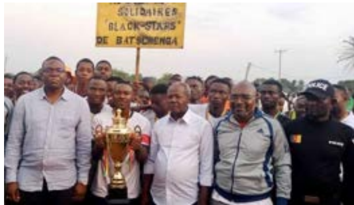
Trophy handover to the winner of the Festy Foot Batchenga's championship in the presence of the deputy sub-divisional officer of Batchenga

As an official sponsor, NHPC provided all the teams, their technical staff and referees with sports uniforms, provided all the sports equipment necessary for the organization of the matches (balls, whistles, stopwatches, refereeing cards, medals, trophies, etc.) and refreshments and promoted the championships through communication supports.