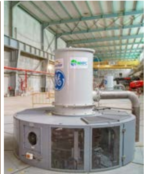
A picture of the Nachtigal hydroelectric facility's Unit No. 4