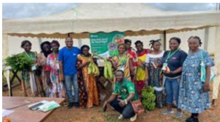
Somes pictures of the Nachtigal Local Market's first edition