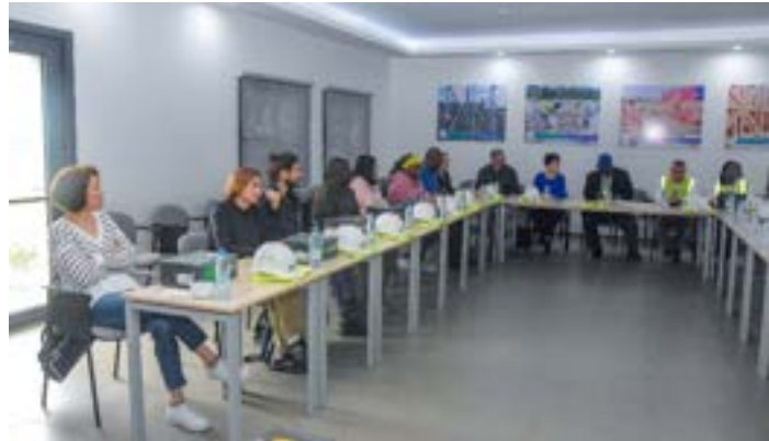
Presentation of the company and the Nachtigal project

This visit was an opportunity for NHPC and the IMF to discuss the contribution of the Nachtigal project to Cameroon's energy sector.