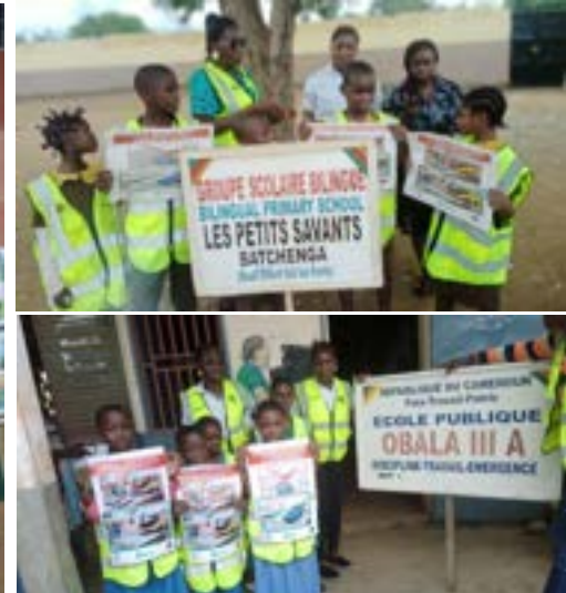
Photos of some road safety clubs