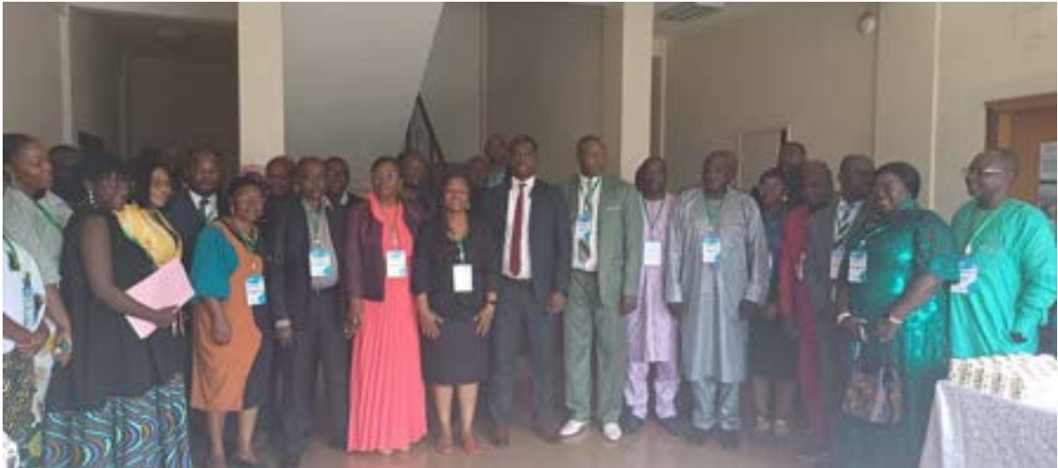
Workshop participants' family picture