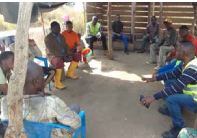
Raising awareness among people working in the DUP area