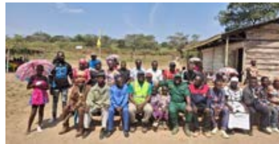
Pictures of the donation and the donation ceremony