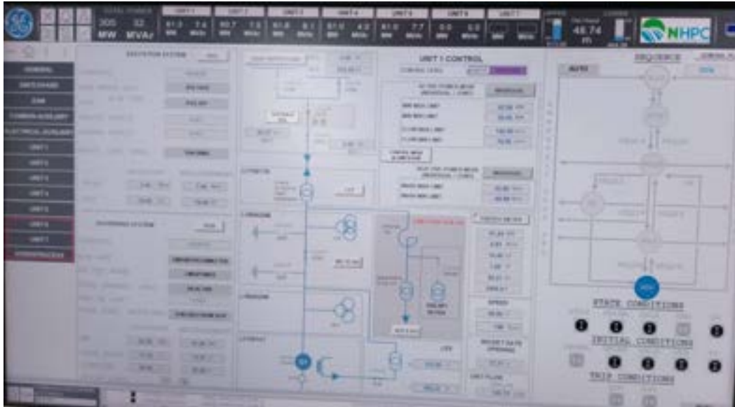
Photo of the Nachtigal hydroelectric facility' control screen