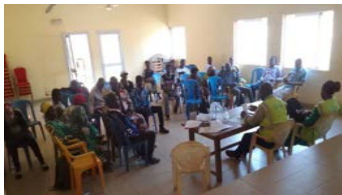
Community consultation forums