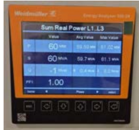
Photos of the connection and synchronization ceremony of the Nachtigal's Unit N°1 to the power grid