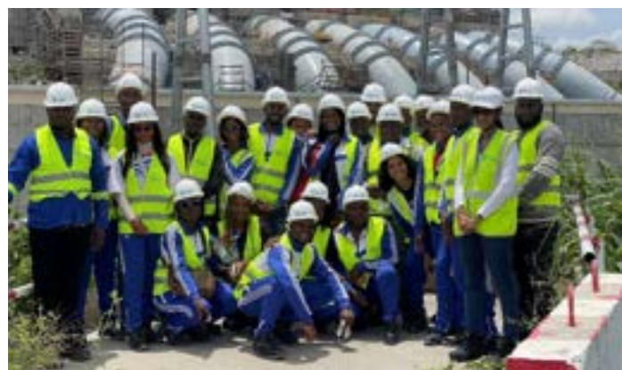
ISAGO students who took part in the masterclass