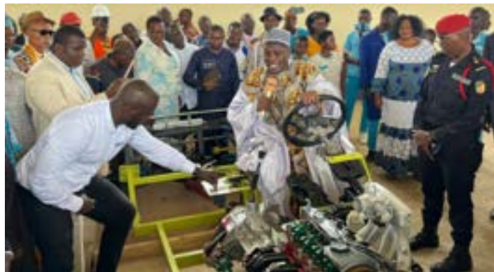
The Minister testing the automobile mechanical workshop equipment at Obala's RA/HEC