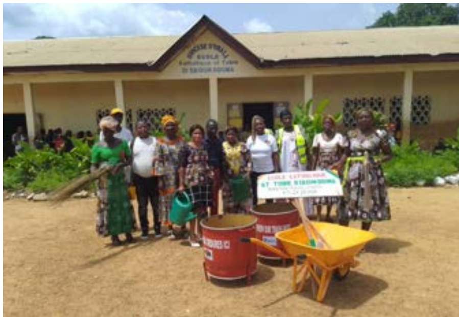
Prize received by St Tobie's Catholic School, Obala