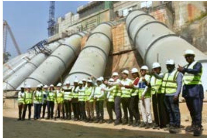
Family photo in front of the penstocks

As a reminder, once commissioned, the Nachtigal project will contribute to 30% of Cameroon's electricity needs with a green, available and affordable energy.