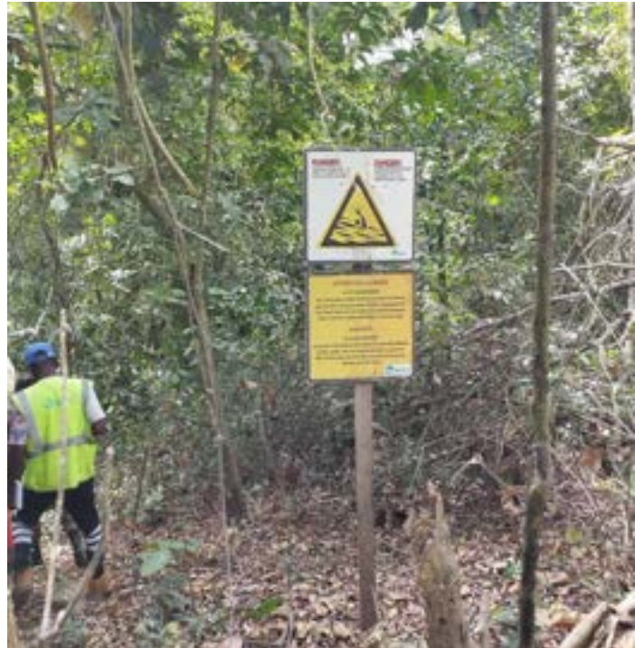
Information board on hydraulic safety risks

This inclusive awareness-raising approach consolidates the prevention measures already deployed by NHPC, including vigilance committees, the installation of warning signs, buoys delimiting the reservoir and warning sirens, and many other actions.