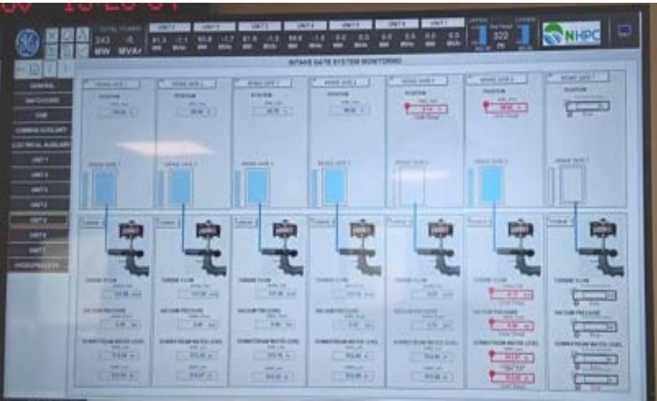
A picture of the Nachtigal hydroelectric facility's control screen