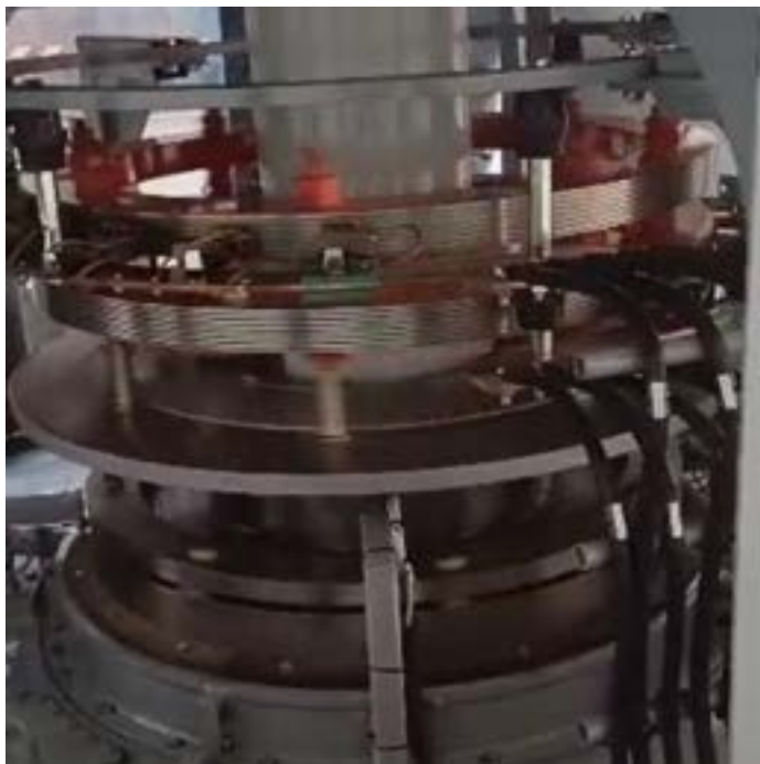
Rotor rings excitation

After these tests, Unit N°1 will be connected to the electricity grid.