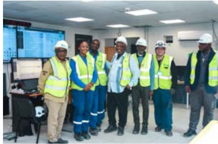
Images of the ADPI-RDC visit to the Nachtigal construction site