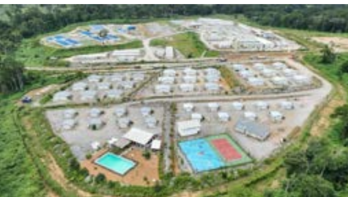
Aerial view of the labor camp

The installation of the Ministry of Defence's teams in this area will help to improve the security of the Nachtigal hydroelectric facility.