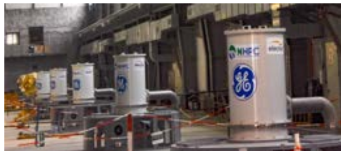
View of the 5 Nachtigal units commissioned

NHPC is committed to deliver the entire Nachtigal hydropower facility by early 2025 to ensure Cameroon has an available and competitive supply of green electricity.