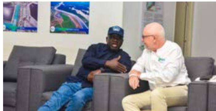
The Managing Directors of NHPC and Mainstream Energy Solutions