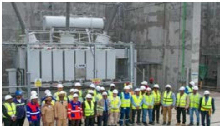
Family picture in front of the transformer N°3