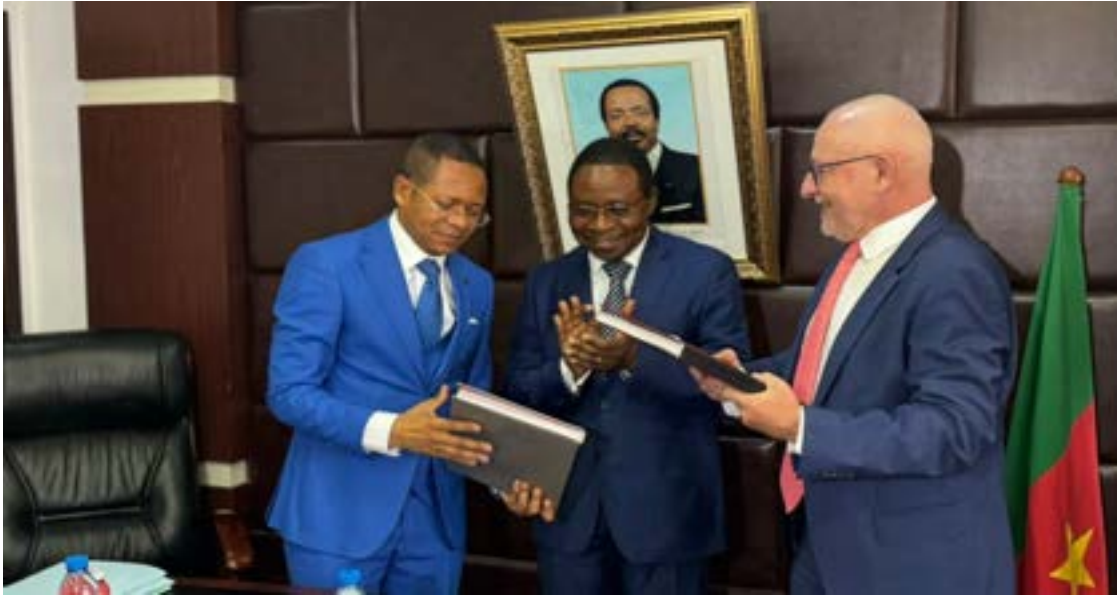
NHPC and SONATREL Managing Directors exchange initials