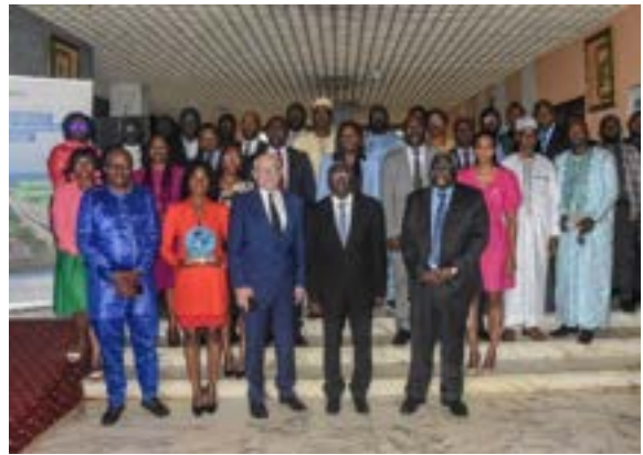
Exchange of initials between the Managing Director of NHPC and the Minister of Livestock, Fisheries and Animal Industries and family picture