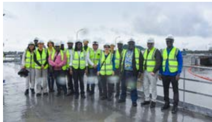
Family photo in the upstream area