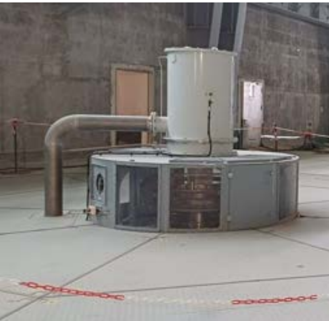
Unit N°2's photo