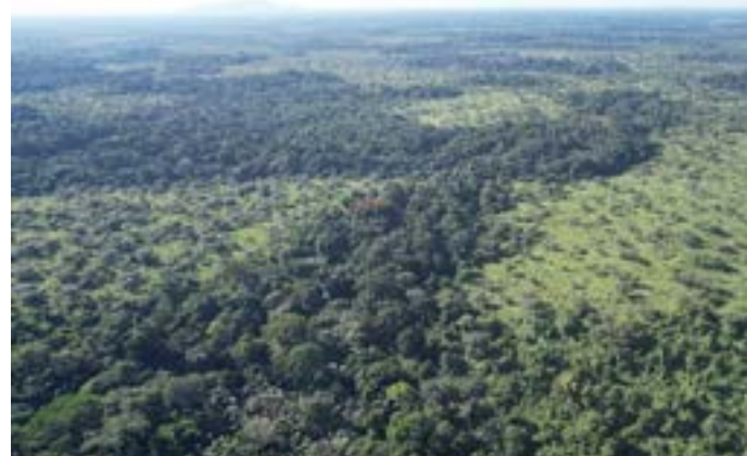
Aerial view of the Mpem and Djim National Park