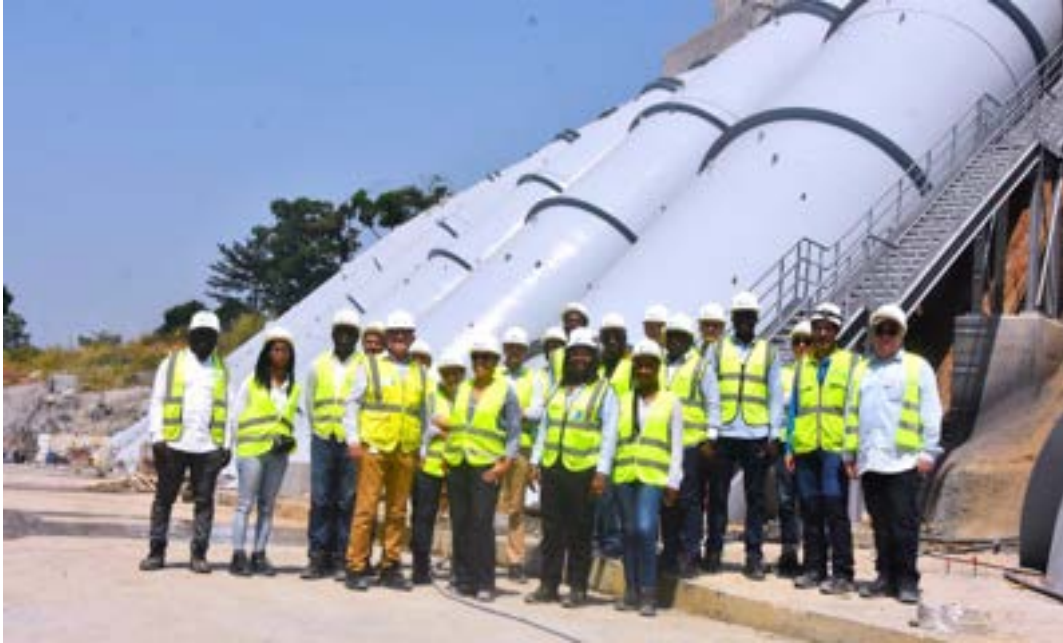
Photo of the site visit