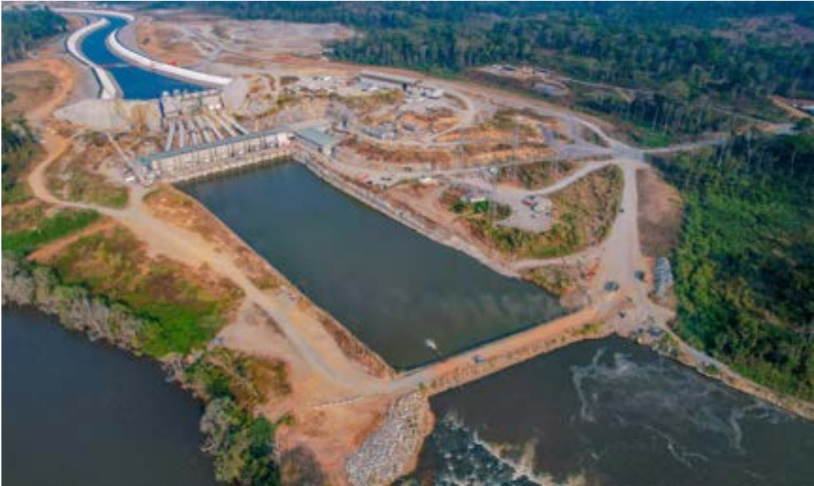
Aerial view of the Nachtigal tailrace