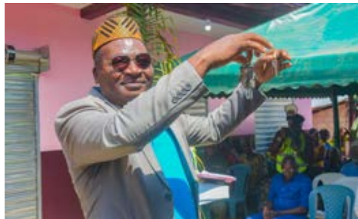
Handover of the shops' keys to the mayor of Ntui

"The Nachtigal project's support for the local development of neighbouring municipalities is now more meaningful than ever with these 20 shops, which not only support the modernization of Ntui's central market, but also help to expand the tax base of our council, which is in desperate need of financial resources to enable its economy to develop effectively".