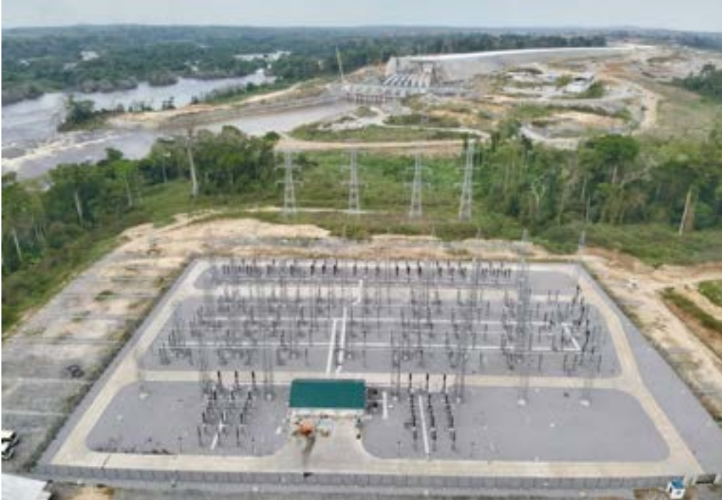
Aerial view of Nachtigal's substation