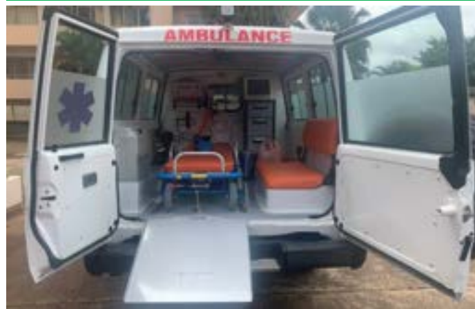
View of the inside of the ambulance