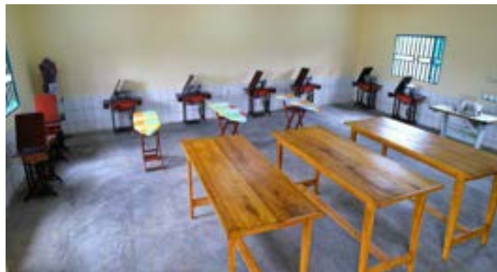
Picture of the RA/HEC clothing workshop in Ntui