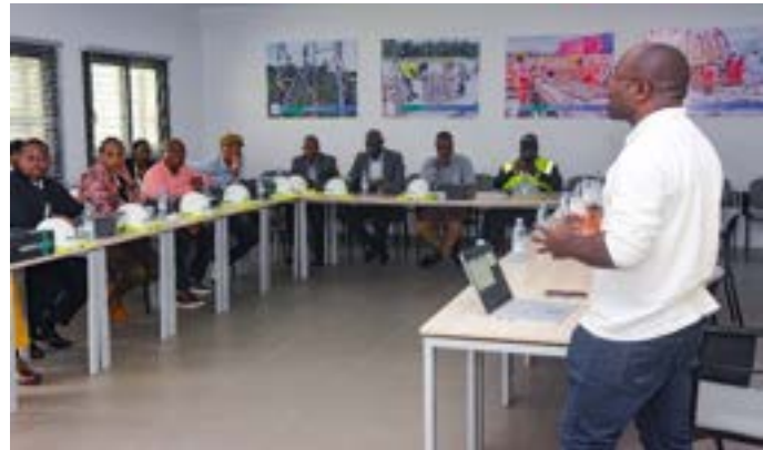
Project presentation at the Public Information Center

It was also an opportunity for NHPC to present the company's strong environmental and social ambition, implemented in accordance with the best international standards and IFC's performance standards on environmental and social sustainability.