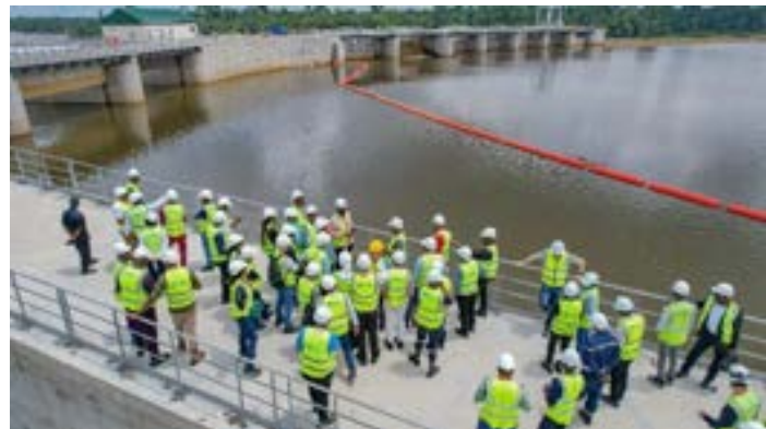
Presentation of the upstream works