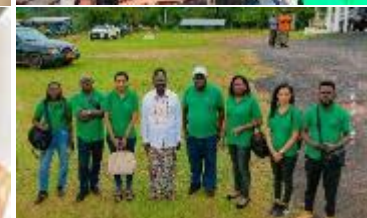
Visit of the Water Museum