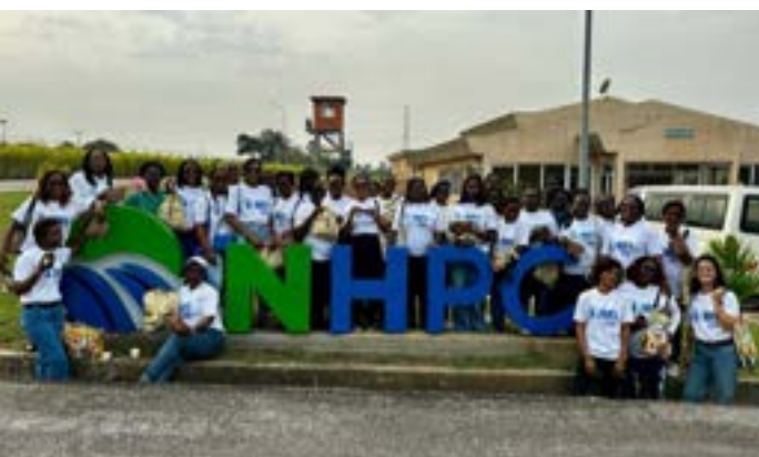
Some pictures of the international women's rights day celebration at NHPC