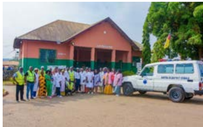
Family picture of the ceremony