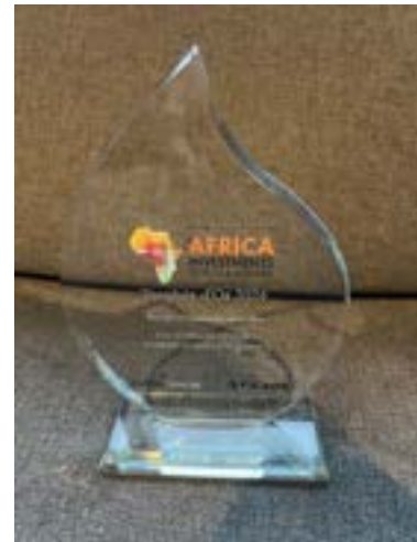
NHPC's Deputy Managing Director receiving Africa Investments Forum & Awards (AIFA)'s prize