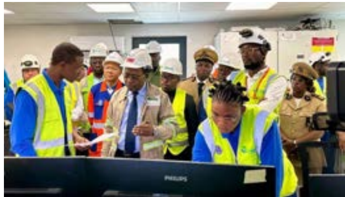
The Minister of Energy and Water Resources visiting Nachtigal's control room

Once fully commissioned in early 2025, the energy produced by Nachtigal will cover about 30% of Cameroon's electricity needs.