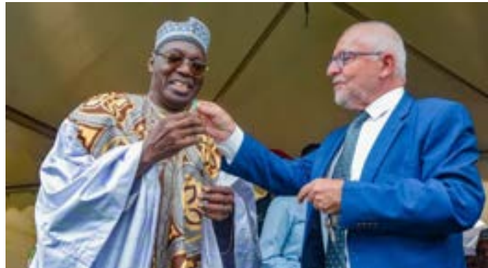
The Managing Director of NHPC handing over the RA/HECs workshops keys to the Minister for Employment and Vocational Training

Through this action, NHPC is renewing its commitment to promote local economic development.