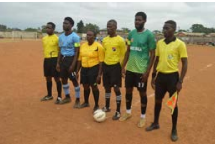
Final of Sa'a's Championship «Championnat de Redynamisation Sa'a 2024»

Through the "PADEL", NHPC is committed to supporting young people in the Nachtigal project area and making them actors in the economic development of their respective territories.