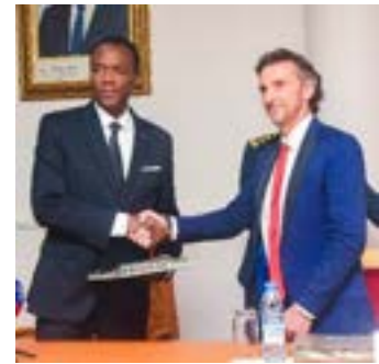
Exchange of initials between the Minister and CCN and Elecnor Directors