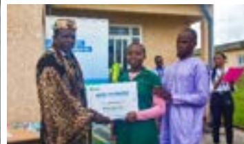
A few images of the awards ceremony