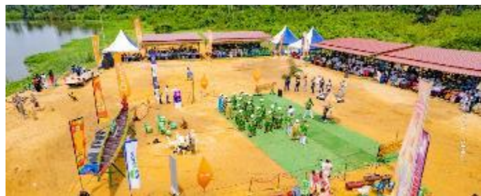
NHPC at the MADIBA 2024 Festival