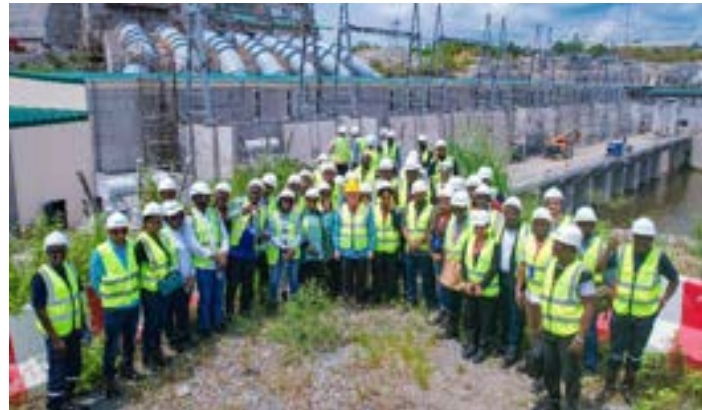
Family picture of the visitors at the water intake

Beyond this agreement, the two entities are considering expanding their collaboration. CAMRAIL, in particular, wishes to involve NHPC in its future safety days in order to share experiences on common areas of interest.