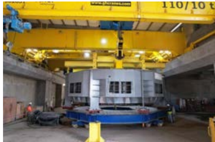
Nachtigal's last stator installation's pictures