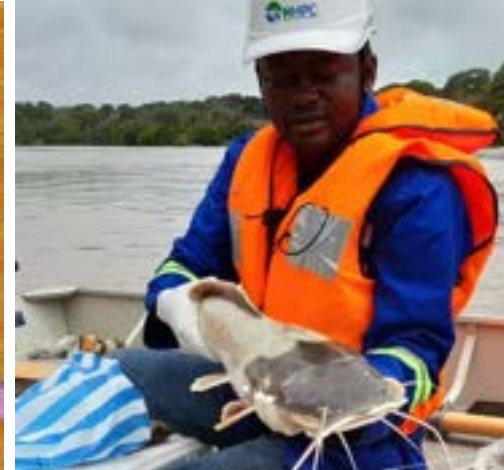
Brycinus macrolepidotus and Clarias inventoried during the first experimental fisheries campaign