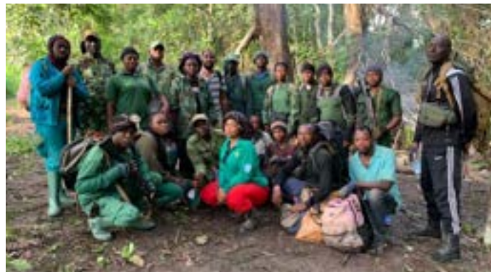
Photos of the theoretical and practical phases of the training given to eco-guards