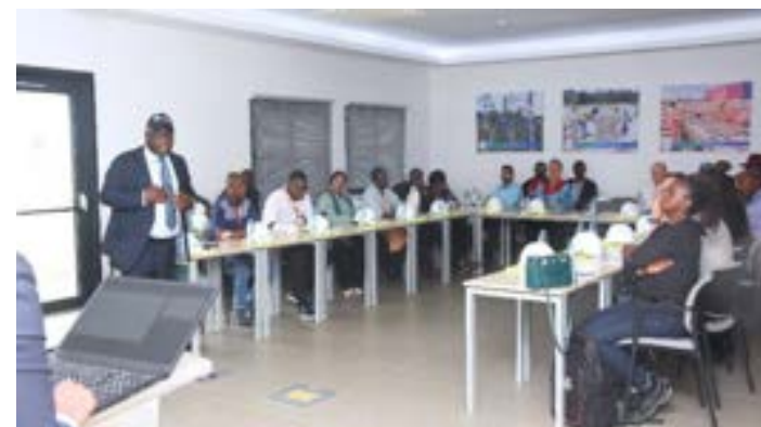
Presentation of the project by NHPC's Deputy Managing Director