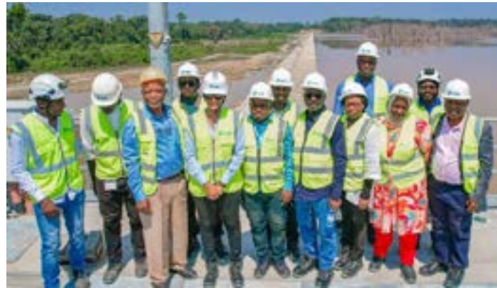
Family picture in front of the main dam

Such collaborations strengthen ties among key players in the energy sector and advance a shared vision for sustainable and responsible hydropower development across the African continent.