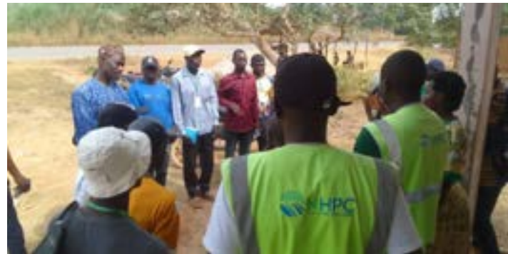
Reflection group on the sustainable fishery resources strategy