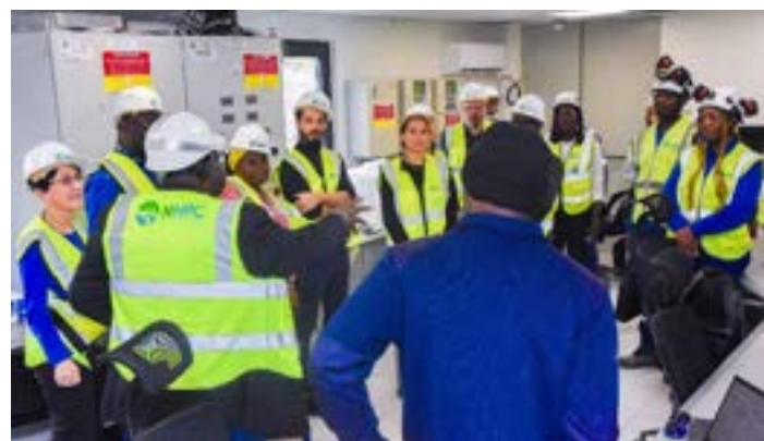
The IMF delegation in the Nachtigal control room