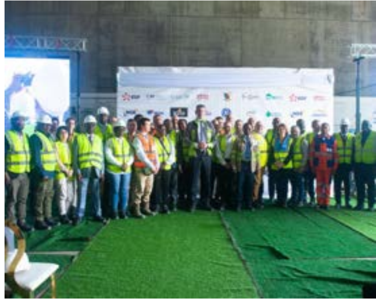
A few images of the Demonstrative Global Capacity Certificate's signing ceremony