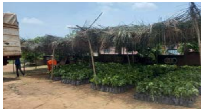
Pictures of seeds offered to PAPs

The Nachtigal project's Resettlement Action Plan is a document drawn up following various surveys and inventories carried out in the project area, which proposes individual compensation measures in the form of land replacement, crop compensation and support for the development of local fisheries, as well as community compensation measures for the loss of community resources.